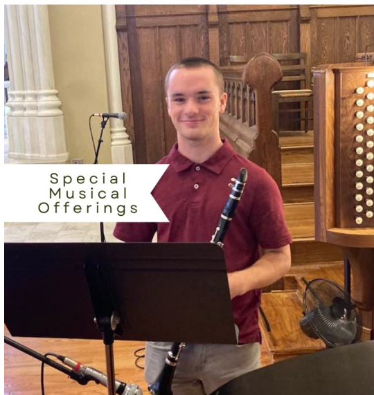
Special Musical Offerings