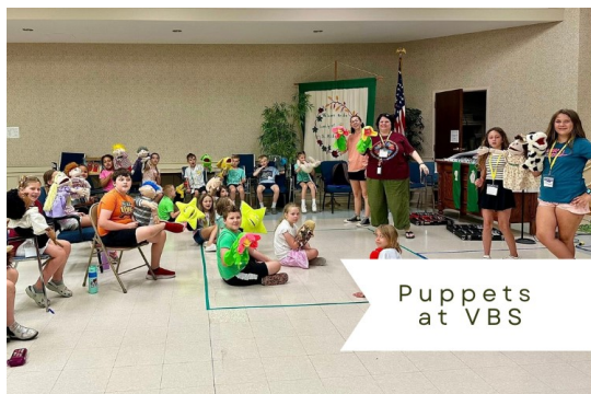
Puppets at VBS