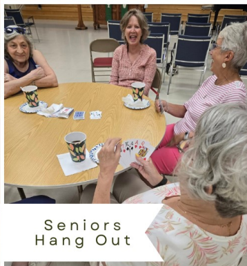
Seniors Hang Out