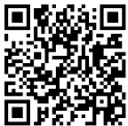
Music Camp QR Code