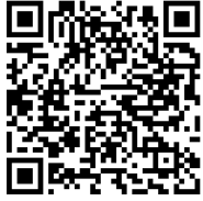
Day Camp QR Code