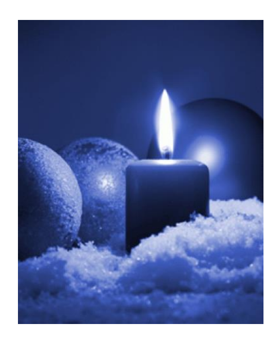
Please note: Music for this service is covered under CCLI # 1000682 – Also #A-708989 One License.net