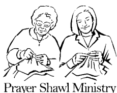
Prayer Shawl Ministry